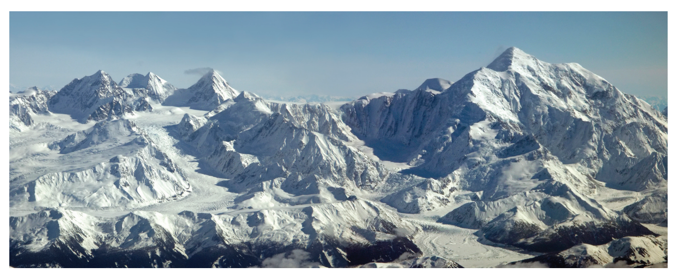
Mount Fairweather and its neighbors, as viewed from the outer coast (west).