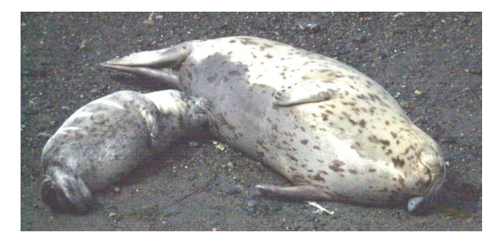
Figure 1. Harbor seal female and nursing pup.

We conducted shore-based counts of harbor seals in Johns Hopkins Inlet, a tide-water glacial fjord in the northwest arm of Glacier Bay, during the pupping season (June, fig. 1) from 1992 to 1999 and during the annual molt (August) from 1992 to 2002. From 1992 to 2001 aerial photographic surveys of seals at terrestrial haulouts in August were also conducted. Environmental and observer-related covariates were recorded during each count and survey.